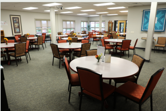
Stoner Prairie Dining

Mon-Thurs: 4:30-9pm | Fri: 2:30-10pm | Sat: Noon-10pm | No Sunday Rentals.