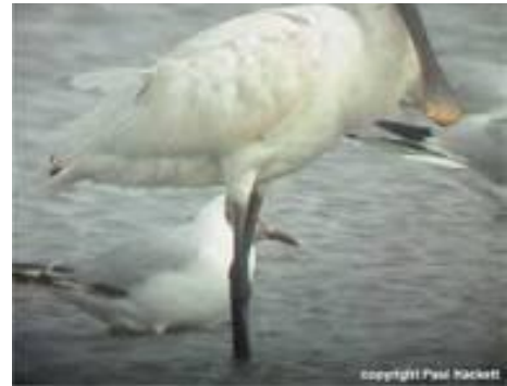
Left to right: wood stork, egret, and spoonbill