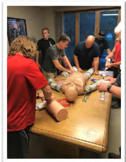
Tactical EMS / Wound Treatment