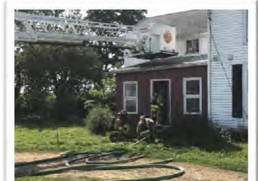
Hose Movement / Structure Fire