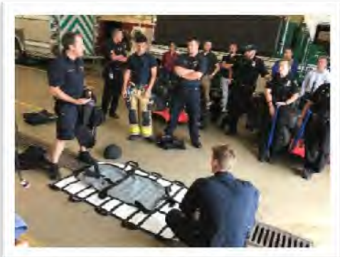
Inter-Agency Casualty Response